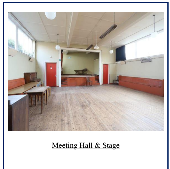
Meeting Hall & Stage